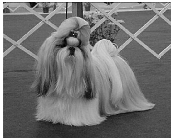
Am Can Braz Thai Champion Souyen's Setting the Mood 'Tommy'