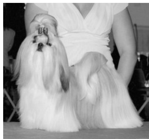
American Canadian Champion Souyen's Can't Rush Perfection 'Macy'