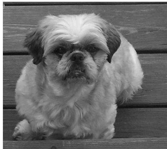
Woody enjoying the good life!