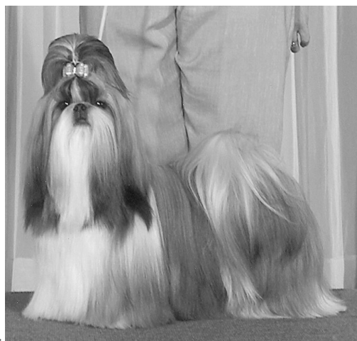
American Canadian Champion Souyen's Price of Perfection 'Price'

This Woody son had a great show career. He is a multiple Best in Show winner. His American Canadian get can be seen below. Once again showing the great stamp Woody has put on our lines.