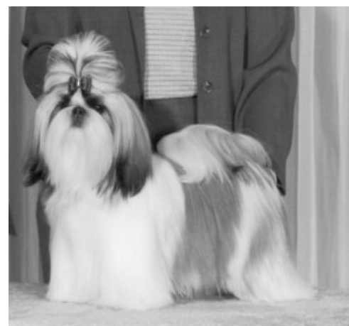
American Canadian Champion Souyen's Secret Setting 'Chelsey'