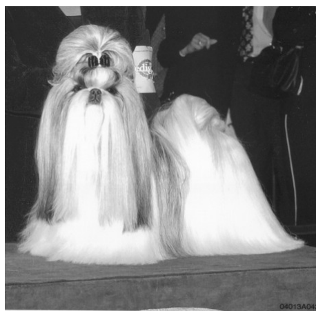
Am Can Braz World Champion Souyen's Piece of Perfection ROM 'Shandy'

Missy is a Woody daughter born in 1998. Woody's impact on our lines can be seen through Missy's American & Canadian Champion get seen below. (Only Am. Can. Ch. Children are pictured below)