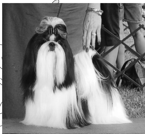
American Canadian Champion Souyen's Ultimate Setting 'Mickey'