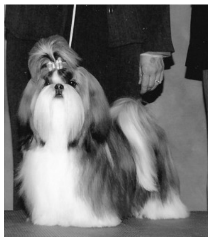
American Canadian Champion Souyen's Perfection is Key 'Lucca'